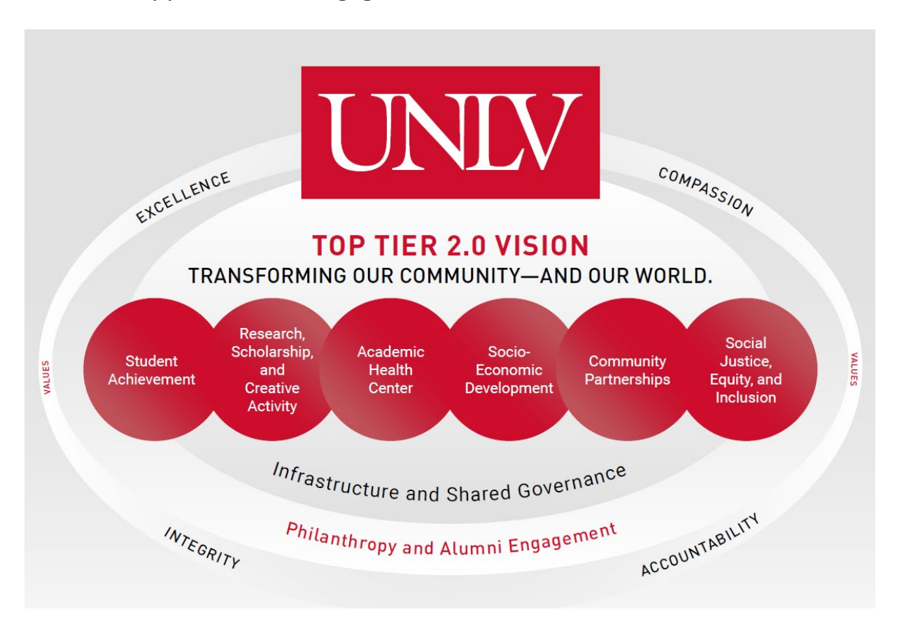
Figure 1 – Top Tier Vision, Core Areas, and Values